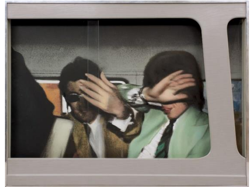
Richard Hamilton, Swingeing London '67, 1968, Relief, screenprint on oil on photograph on hardboard, Pallant House Gallery, Chichester (Wilson Gift through Art Fund, 2006)

An exhibition of paintings, drawings and prints by celebrated British pop-artist Richard Hamilton, will explore the influence of international modernism and the artist Marcel Duchamp on his work. Featuring 20 works by Hamilton from Pallant House Gallery's important collection of British Pop art, the exhibition will include celebrated works such as Hers is a Lush Situation (1958); Adonis in Y-Fronts (1963) and Swingeing London '67 (1968). Also on display will be The Oculist Witnesses (1967), a work created by Hamilton in collaboration with Duchamp. Hamilton helped to popularise Duchamp's work, introducing him to a British audience in 1966 when he organised a retrospective of his work at the Tate Gallery for which he also helped to recreate one of Duchamp's most famous works The Bride Stripped Bare by her Bachelors Even (1915 – 23).