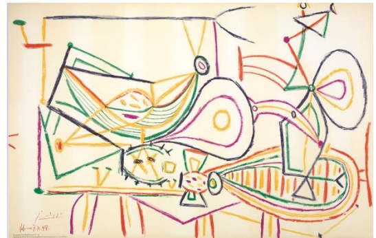
Pablo Picasso, Composition, from the School Prints, 1949, Lithograph on paper, Pallant House Gallery, Chichester (Purchased with support from an Anonymous Donor, 2007)