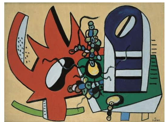
Fernand Léger, L'Engrenage Rouge (Nature morte en rouge et bleu) / The Red Gear (Still Life in Red and Blue) , 1939, Oil on canvas, Pallant House Gallery, Chichester (Kearley Bequest, through The Art Fund, 1989) © ADAGP, Paris and DACS, London 2020