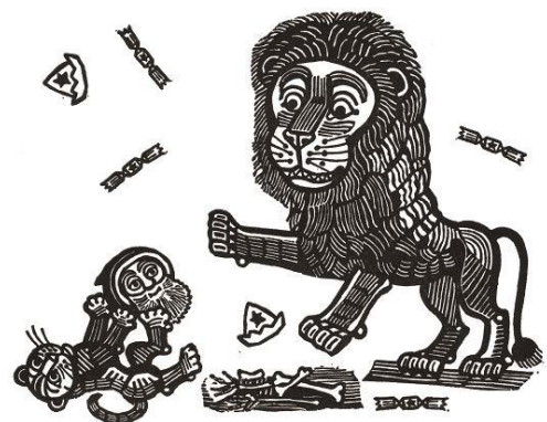
Edward Bawden, Christmas card design