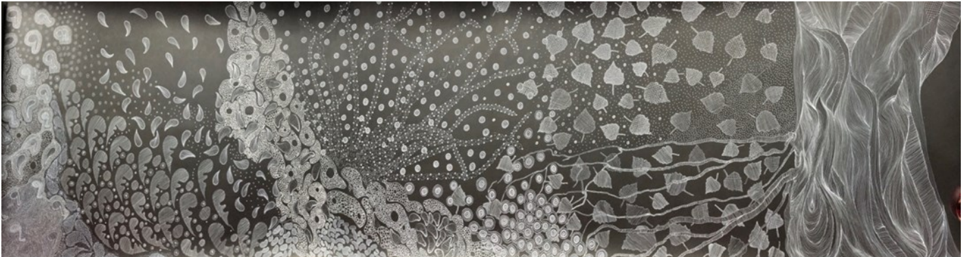
Enter These Enchanted Woods [excerpt] [2020)

This resource by Julia Oak is inspired by her exhibition