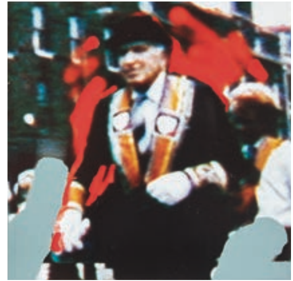
Richard Hamilton (1922–2011) Orange Order (1991) Humbrol enamel on cibrachrome Wilson Gift through Art Fund (2006)