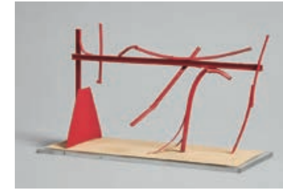
Anthony Caro (1924–2013) Small model of 'Sculpture Three' Original sculpture (1962) Mixed media Wilson Gift through Art Fund (2006)