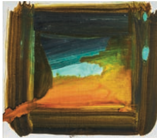
Howard Hodgkin (1932–2017) End of the Tunnel (2000) Oil on card Wilson Gift through Art Fund (2006)