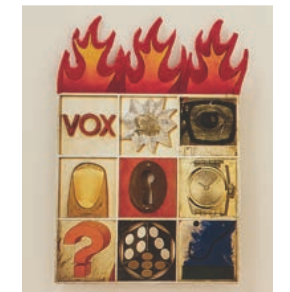
Joe Tilson (b.1928) 9 Elements (1963) Mixed media on card Wilson Gift through Art Fund (2006)