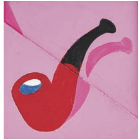
Patrick Caulfield (1936–2005) Pipe on Table (2000) Paint on board Wilson Gift through Art Fund (2006)