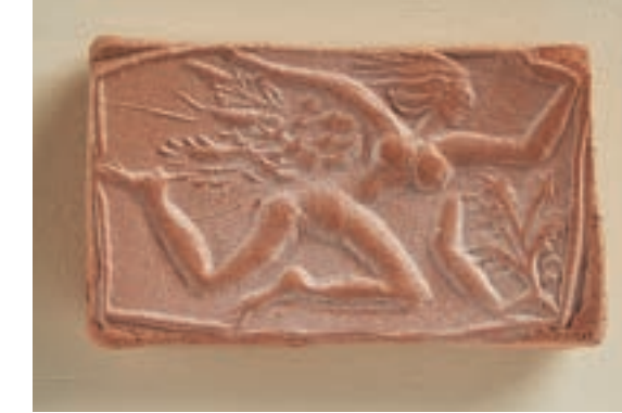
Dhruva Mistry ( b.1957) Untitled Sculpture (1988–9) Relief terracotta sculpture Wilson Gift through Art Fund (2006)