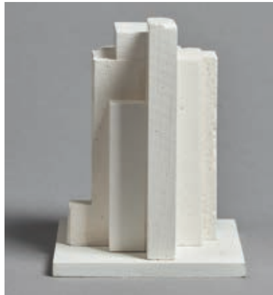
Eduardo Paolozzi (1924–2005) Project for Monument (2000) Plaster Wilson Gift through Art Fund (2006)