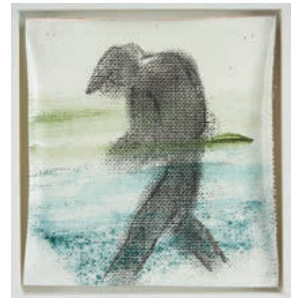
R. B. Kitaj (1932–2007) Michael Andrews as a Thames Bargeman, after Whistler (1999) Oil on canvas Wilson Gift through Art Fund (2006)