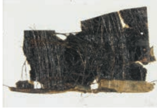
Prunella Clough (1919–1999) Demolition (1998/9) Pencil drawing/ ink collage on paper Wilson Gift through Art Fund (2006)