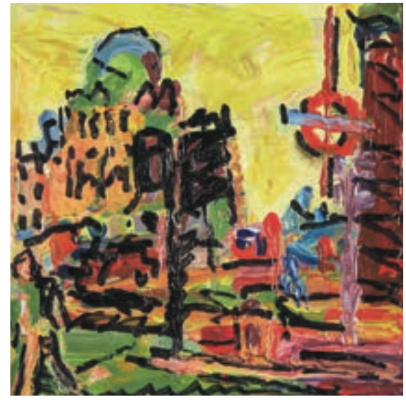
Frank Auerbach (b.1931) Camden Palace (2000) Oil on board Wilson Gift through Art Fund (2006)