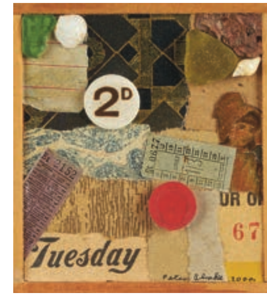
Peter Blake (b.1932) Tuesday (2000) Mixed media Wilson Gift through Art Fund (2006)