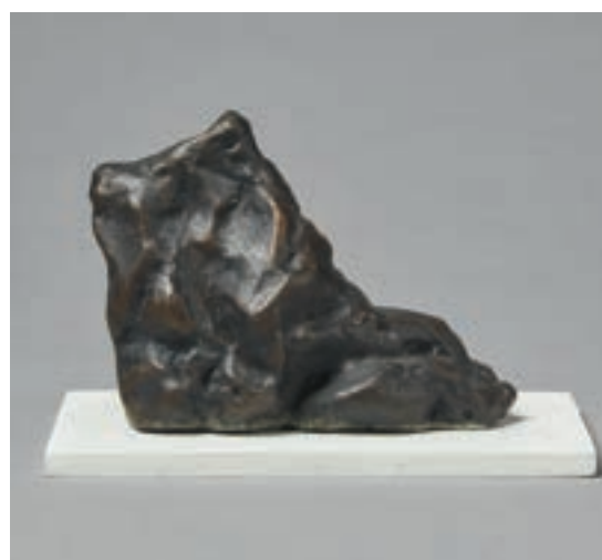
William Tucker (b.1937) Study for Leonidas (1994) Bronze Wilson Gift through Art Fund (2006)